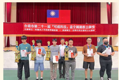
▲ "Catcher Cup" Go Tournament Awards Ceremony

Since 2003, Catcher, together with the Catcher Educational Foundation, has organized the “Catcher Cup” National Go Tournament to encourage a balance between academics and leisure while fostering cultural and intellectual development. In 2024, the 21st tournament was held on May 5 at the gymnasium of the Tainan Municipal Xinying Stadium, attracting more than 700 participants from across the country. Through the promotion of Go education, the tournament seeks to instill virtues such as patience, concentration, and logical thinking among young people, while also contributing to the cultivation of a positive and enriching social atmosphere.