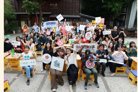
▲ Opening Ceremony Press Conference of the Sustainability Education Exhibition

Catcher has long collaborated with the Tainan Enterprise Culture and Arts Foundation on sustainability initiatives, weaving environmental education into activities such as Catcher's Volunteer Family Day. Both Catcher and Tainan enterprises share the vision of building a sustainable Tainan and continue to support each other in this effort. In 2024, as Tainan marked its 400th anniversary, the Foundation once again invited Catcher to participate in the "Tainan 400 – Good Tainan Sustainable Action." Through 17 large-scale sustainability education exhibitions and a series of related activities, the initiative helped integrate sustainability concepts into the daily lives of children and families, fostering lasting awareness and sustainable lifestyles.