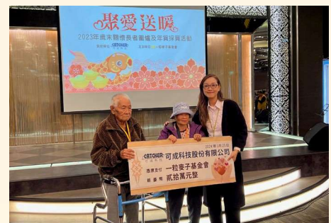
▲ Year-End Elderly Care Banquet and New Year's Goods Shopping Event

Catcher is dedicated to supporting disadvantaged elderly groups in Tainan. Since 2017, the Company has sponsored the "Year-End Elderly Care Banquet and New Year's Goods Shopping Event" organized by the A Kernel of Wheat Foundation. In 2024, the event brought together 101 disadvantaged elderly and disabled individuals, who were invited to enjoy a festive banquet. Local social welfare groups also delivered wonderful performances, creating a joyful and heartwarming atmosphere ahead of the Lunar New Year. Through this initiative, Catcher seeks to leverage its corporate resources to support the Foundation's efforts in providing care and companionship for disadvantaged elderly groups, ensuring that this spirit of social warmth continues to flourish.