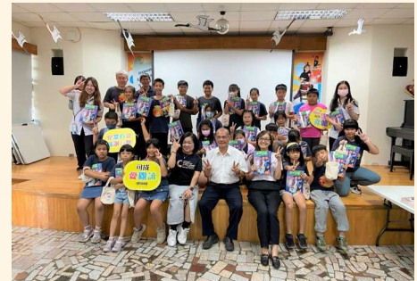
▲ Enthusiastic Participation of Students from Jian Gong Elementary School

Since 2014, Catcher has been a long-term sponsor of the “Sowing Seeds of Reading: Giving Children a Future” program organized by the Global Views Education Foundation. Through this initiative, students in 150 schools across remote areas of Tainan City have gained access to the latest issues of Future Youth magazine. In 2024, Catcher visited Jian Gong Elementary School in Qigu District, one of the participating schools, to engage in discussions and interactions with teachers and students. This exchange provided valuable insights into the needs of children in rural communities and offered encouragement to help them transform the knowledge they acquire into strength, opening up new opportunities and enhancing their future competitiveness.