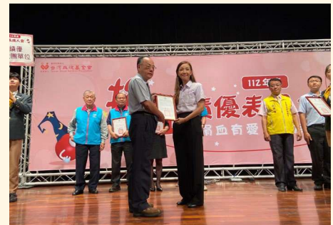
▲ Outstanding Blood Donor Award

Since 2021, Catcher has also supported the Tainan Blood Center’s Corporate Blood Donation Week to inspire broader community involvement. In 2024, this initiative drew 2,260 participants and generated 884,750 cc of donated blood. For four consecutive years, Catcher has been recognized by the Taiwan Blood Services Foundation as an Outstanding Blood Donation Unit, a testament to the Company’s dedication to social responsibility and community health.