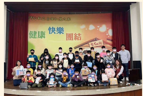
▲ Charity Gifts Delivered to Children

Since 2015, Catcher has partnered with the neighboring Ren-Ai Child Care Center to host annual caring events. In 2024, the "New Year Love Campaign" invited 32 children from the center to share their wish lists. Catcher employees voluntarily selected these wishes and personally prepared gifts, demonstrating their commitment to caring for the local community. Nearly 100 employees took part, ensuring that each child received a thoughtfully prepared and practical New Year gift. In addition, employees collectively donated NT$51,000, which was provided to the child care center to support its operations and needs.